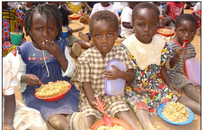
Nutritional meals for Orphans in Malawi are provided by CitiHope International.