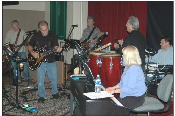
Healing Stream "rocks out" at Burlingame UMC on Friday nights and Sunday mornings.