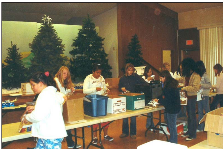
Members of Girl Scout Troop #2 of Merced help assemble the 4,000 packets.

Thirty-one boxes were trucked to the prison on